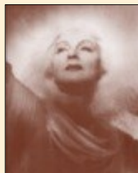
Ruth St. Denis

Hazrat Inayat Khan, who first brought Sufism to the West in 1910, and