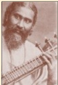
Hazrat Inayat Khan